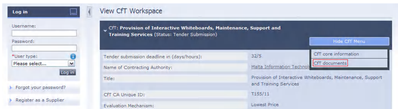
Figure 2. The “CFT documents” link within the CFT Menu.

Once you have accessed the CfT of interest, you will be shown its core information. Clicking the SHOW CFT MENU from the top-right of the screen will display the link to the CfT documents, as per Figure 2.