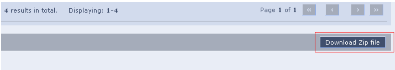
Figure 7. The “Download Zip File” button.

A faster way of downloading the entire documentation pack is to click on the download zip file button at the bottom left of the screen as shown in Figure 7.