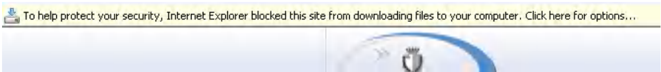
Figure 5. A typical browser message advising that a file has been prevented from being downloaded

In a situation similar to the one shown in Figure 5, clicking the message bar and clicking the download file link will allow you to proceed (you could have to repeat the download process though).