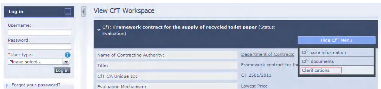
Figure 10. The “Clarification” link within the CFT Menu.

As a guest user, you will still have access to view/download clarifications, addenda and corrigenda. These can be uploaded in the NOTICE AND CONTRACT DOCUMENTS section of the Cft. Additionally, they can be also be uploaded in the CLARIFICATIONS screen within the Cft workspace when the tender procedure is electronic (that is, tenders are to compiled and submitted electronically). This screen is available from the Cft menu as shown in Figure 10.