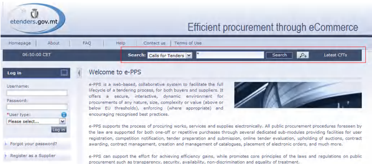
Figure 1. The search facility, and the “Latest CFTs” link in the EPPS homepage.