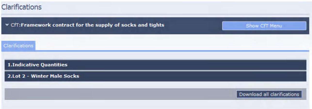
Figure 11. The “Clarification” Screen

The CLARIFICATIONS screen will display any clarifications as per Figure 11. Clicking the clarification name will expand the screen as per Figure 12.