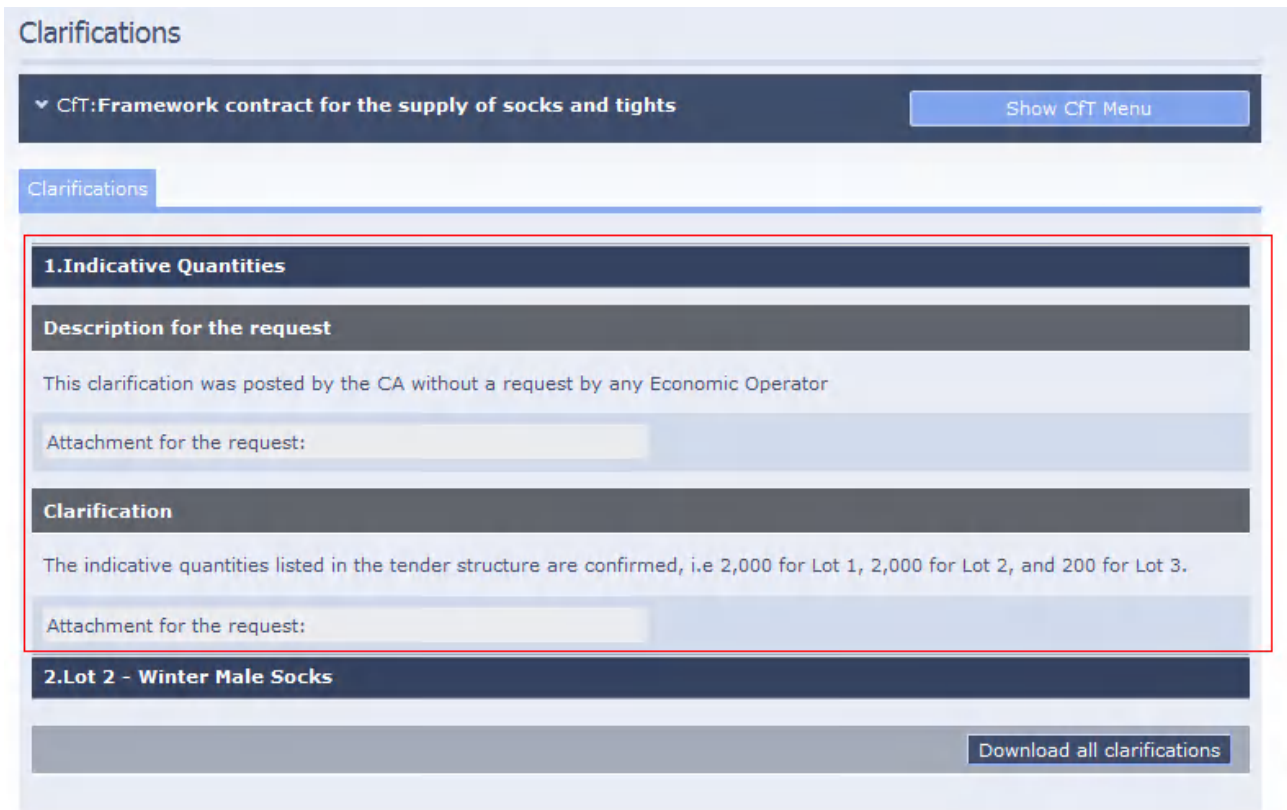
Figure 12. An expanded clarification note.

The online clarification note includes a description/subject matter, the clarification text, and optionally a file attachment related to the clarification note.