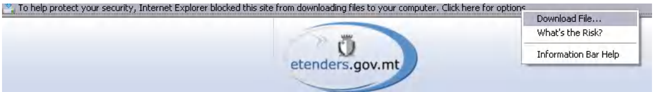
Figure 6. Clicking the message bar, you will be shown the “Download File...” link

In a situation similar to the one shown in Figure 5, clicking the message bar and clicking the download file link will allow you to proceed (you could have to repeat the download process though).